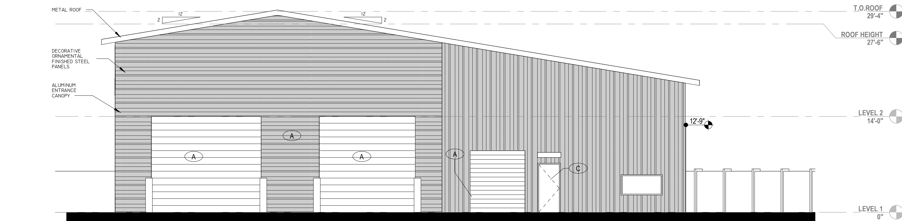
4 NORTH ELEVATION 1/8" = 1'-0"