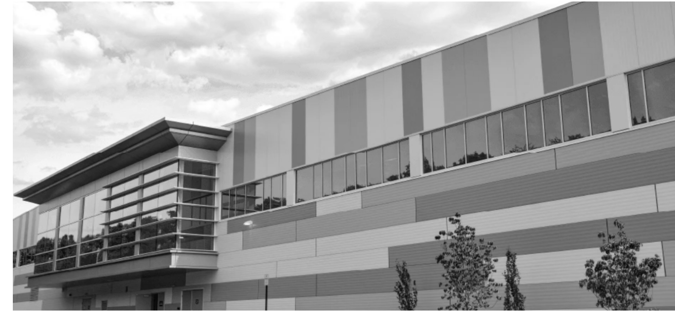
FACADE CLADDING REFERENCE