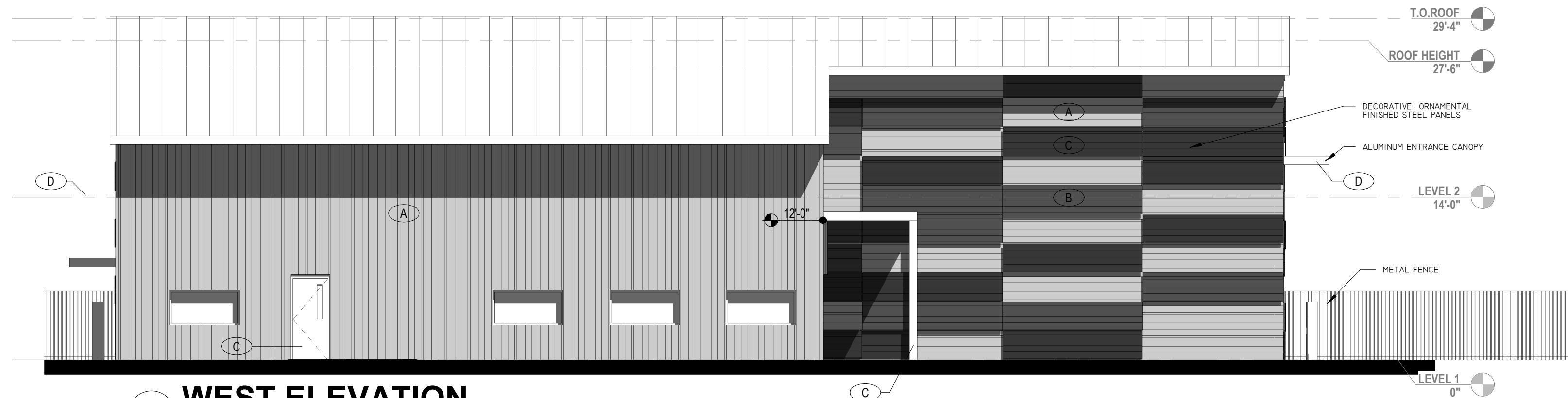
2 WEST ELEVATION 1/8" = 1'-0"