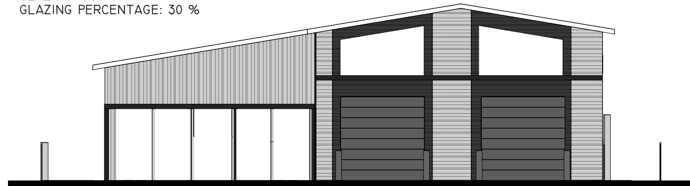
7 SOUTH ELEVATION GLAZING

GLAZING OVERALL FACADE: 1,836 SF GLAZING: 560 SF GLAZING PERCENTAGE: 30 %